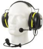
AK5850BHS Ex TwinCom Headband Headset w/ear plug connector

Ex-approved Headset with helmet mounting and connector for ear plug